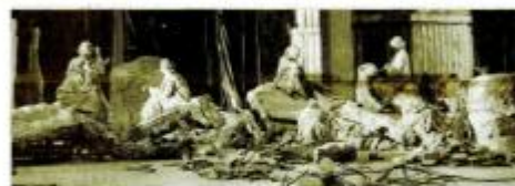
Endgame The wit to Am Anfang at Opera Bastille (above, left) and (right), by Anselm Kiefer (above)